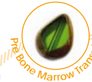
Pre Bone Marrow Transplant