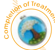
Completion of Treatment