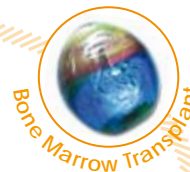
Bone Marrow Transplant