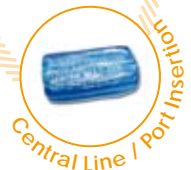
Central Line / Port Insertion