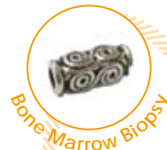
Bone Marrow Biopsy