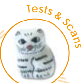
Tests & Scans